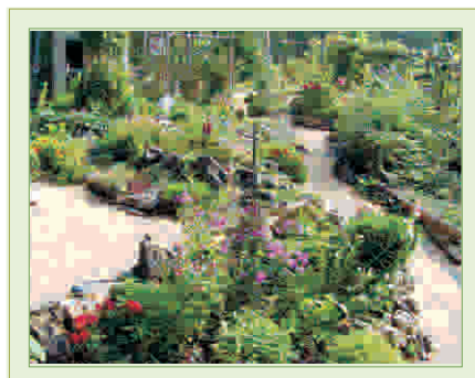
The Gardens of Rural Rootz

The beauty of the Bruce Peninsula lies all around us. The majestic cliffs of Georgian Bay are minutes to our east while to the west lie the white sands of Sable Beach.